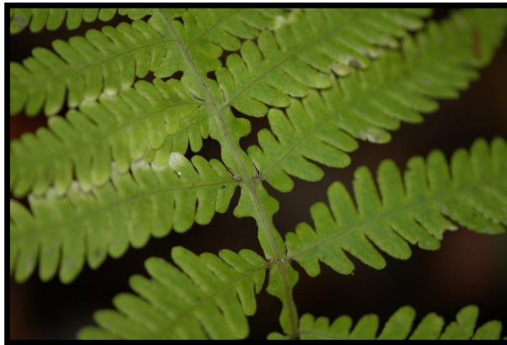
Close-up of winged tissue between bottom pinnae