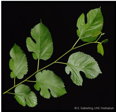
Red Mulberry leaves