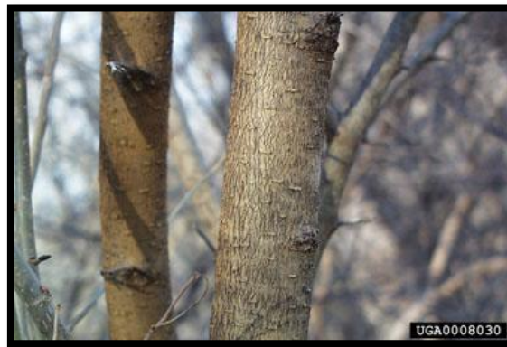
Red Mulberry Bark