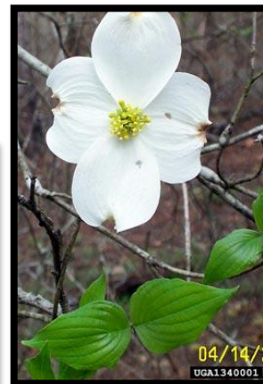
Flower and Leaves