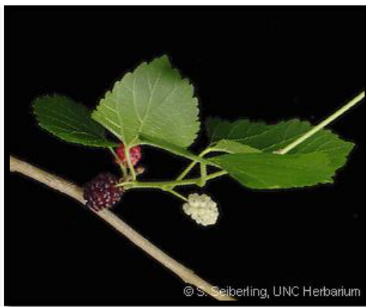
Red Mulberry fruit