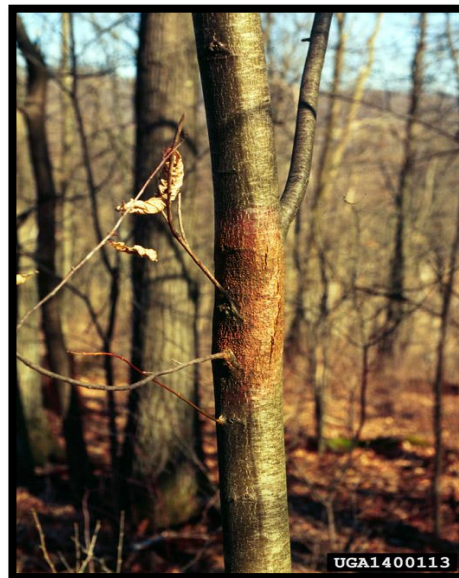
Young Tree with Canker