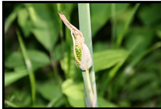
Seed Pod just after Flowering